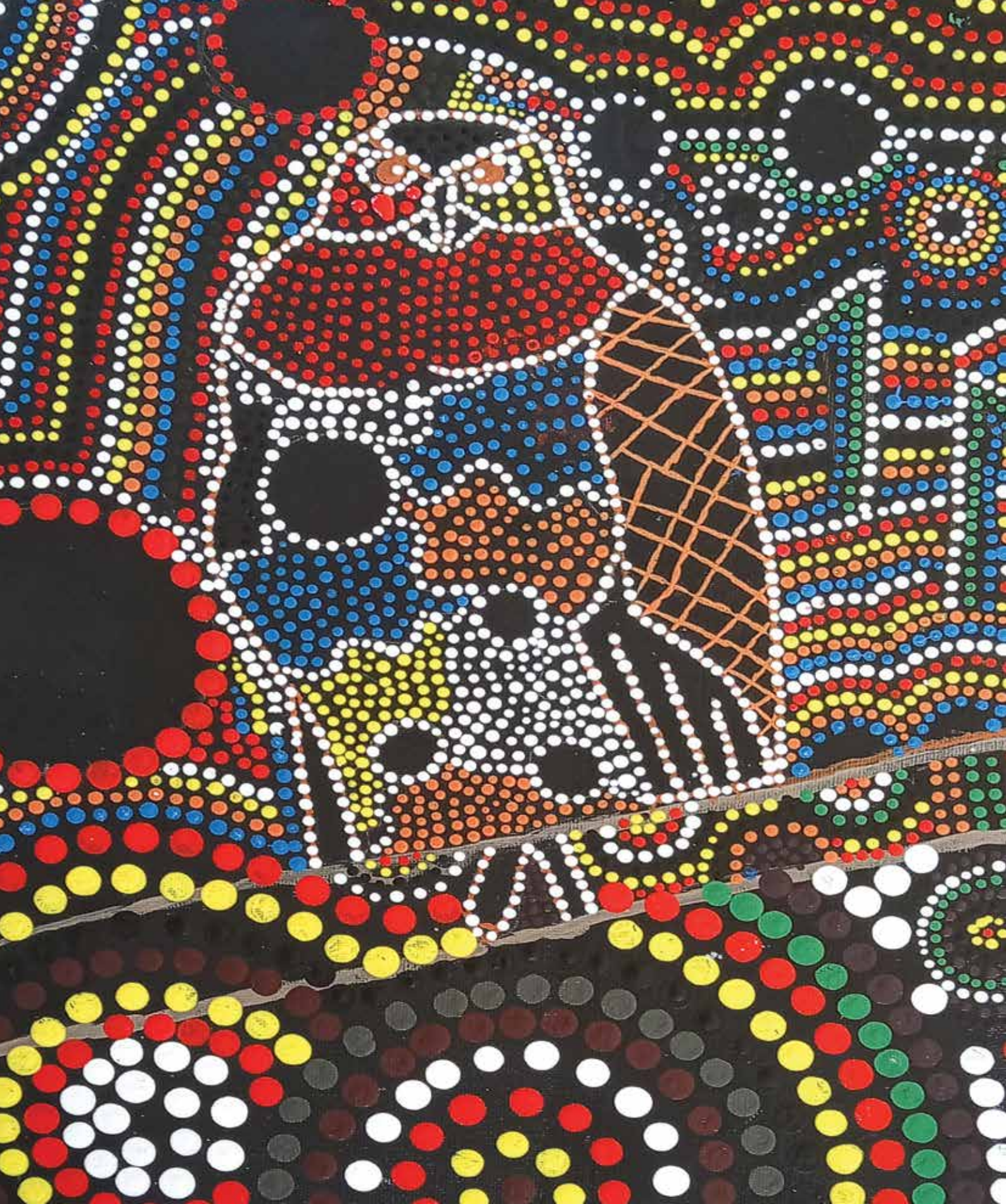
Artist: Tito Bligh (2022)